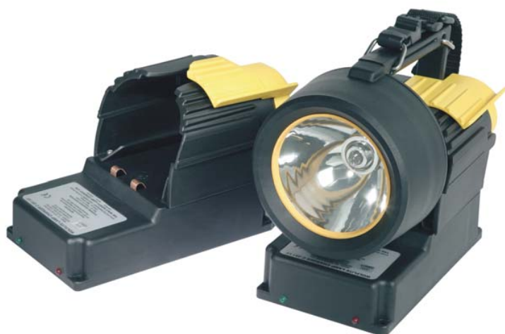
WolfLite H-251A 2.8w spot beam (approx 4°) Peak luminous intensity at 5m 700lux