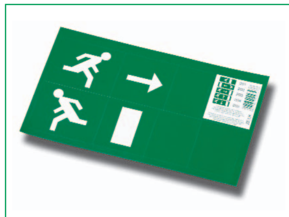
Zeta II legend kit