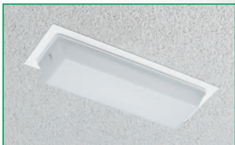
AG Bulkhead with semi-recessing trim plate