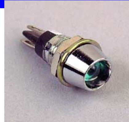
LED-440G 2 volt version shown

The Model 440 LED Indicator Light is a larger version of the Model 407. Available with either chrome body or black anodized body. Voltage range from 2-24 VDC with built in resistor. It mounts in an 8 mm panel hole. The 2 volt version is slightly shorter.