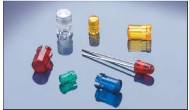
U.S. & Foreign Patents Issued and Pending