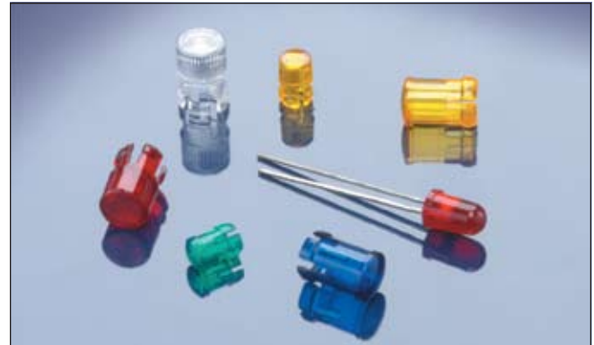
U.S. & Foreign Patents Issued and Pending