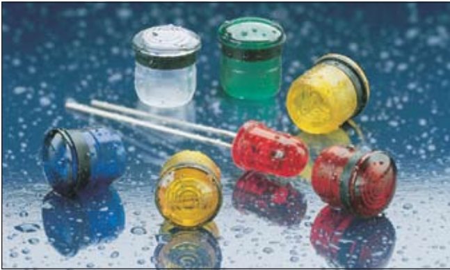
U.S. & Foreign Patents Issued and Pending