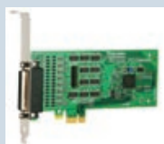
PX-346: PCIe 4xRS422/485 1MBaud