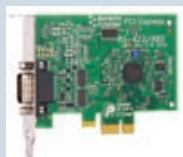
PX-320: LP PCIe 1xRS422/485 1MBaud