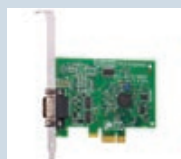
PX-324: PCIe 1xRS422/485 1MBaud