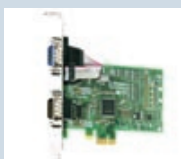
PX-257: PCIe 2xRS232 1MBaud