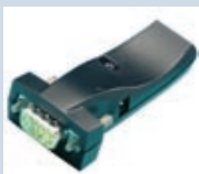
BL-830: BLUETOOTH 1xRS232 FEMALE DCE - CLASS 2

\\puma\Marketing_Dept\Literature\Datasheets\Datasheet_Preparation\INDESIGN_FILES\images\Feature Value Default Value