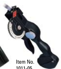
Item No. 1011-05