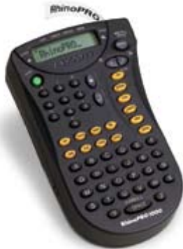
Item No. 15604