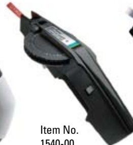
Item No. 1540-00