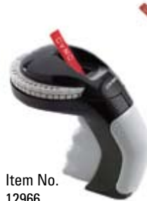
Item No. 12966