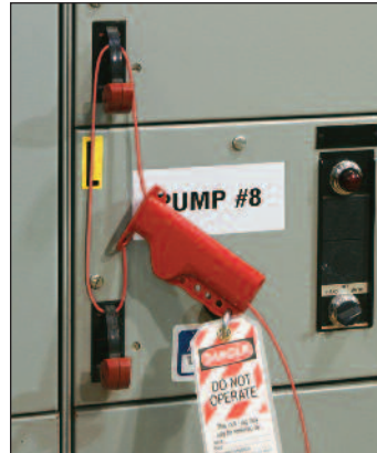
Lockout multiple control points with a single device.