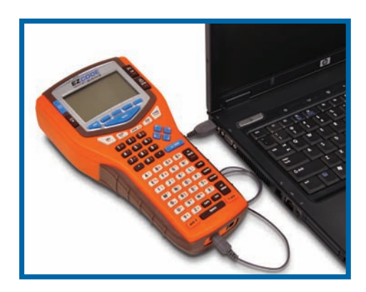
With the included PC connection software and built-in mini USB port, you can print directly from your computer and easily upgrade the software