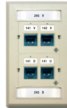
Fixed Length Labels