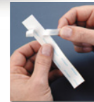
Easy-peel split-back label