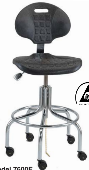
Model 7600E ESD chair with optional casters