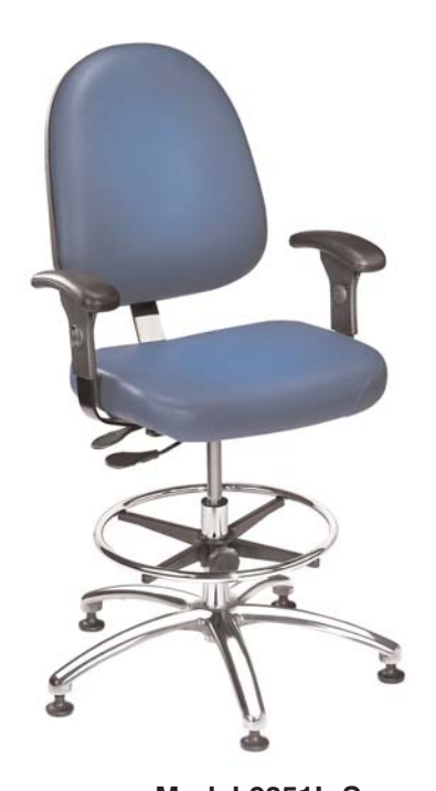
Model 9351L-S w/optional arms and vinyl upholstery