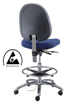
Model 9351L w/optional ESD casters

Each chair features heavy-duty construction, easy-to-use ergonomic chair controls, pneumatic seat height adjustment, 360-degree swivel, sturdy five-legged highly polished cast aluminum base, and mushroom glides. Optional casters include hard floor, carpet, interval brake (lock when not in chair) or reverse brake (lock when sitting in chair) designs. Static control(ESD) casters are also available.