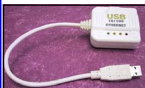
USB Ethernet Adaptor 10/100 Mbps