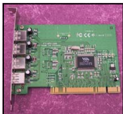
USB Host Cards (PCI)