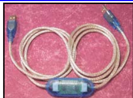
USB Link/Network Cable

They are compatible with USB 1.1 and 2.0 Speeds.