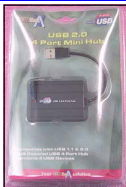
NLUSB2-204 Retail Packed.