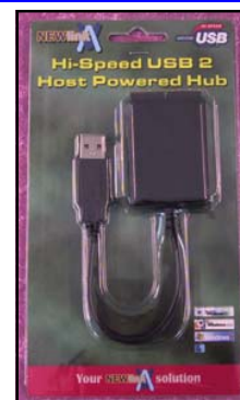
NLUSB2-202 Retail Packed.