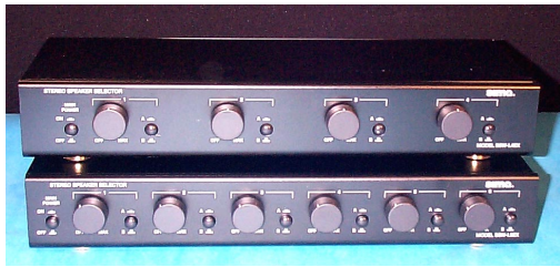
SSW-L4EX (top) and L6EX (bottom)

Music sets the mood, you choose the location. Sima's family of speaker selectors gives you the ability to feed audio in up to six remote locations. Bathroom, bedroom, family room or patio; tune in anywhere in the home.