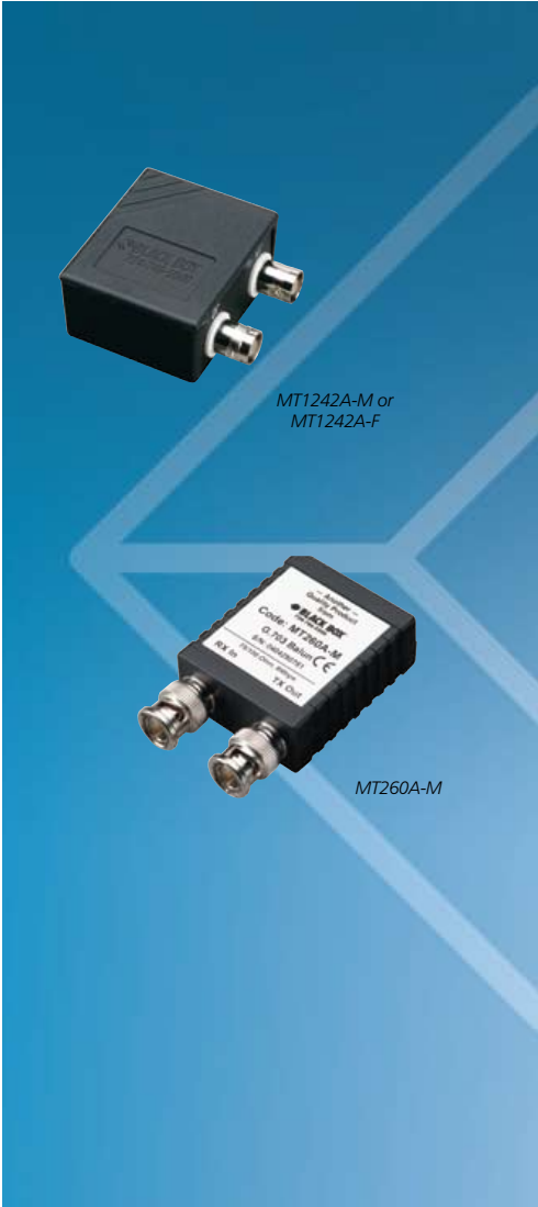
MT1242A-M or MT1242A-F