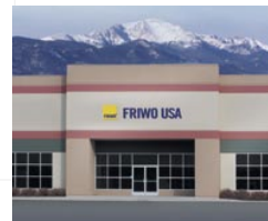
North America, Colorado Springs