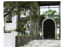
South America, São Paulo