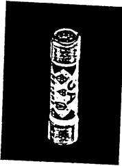
Electrical Ratings (Catalog Symbol and Amperes)