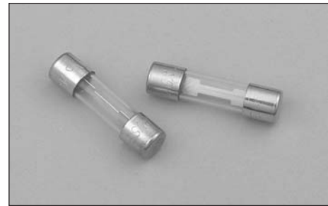
Dimensions - mm (in)