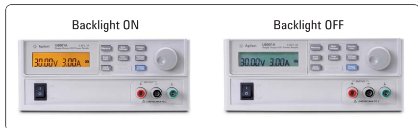
Figure 2. Backlight on/off options for LCD display