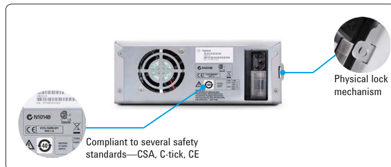
Figure 3. Safety and security features of the U8000 Series single output DC power supplies