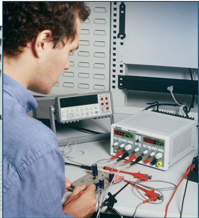
Circuit board design testing using the 30V and 5Vdc outputs