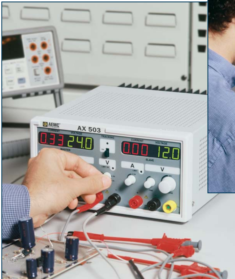
Voltage levels and current limits are easily adjustable from the front panel.