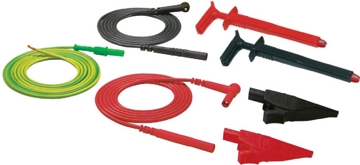
Optional Lead Set includes: two color-coded leads, one ground lead (stripped), two alligator clips, and two grip probes Catalog #2117.78