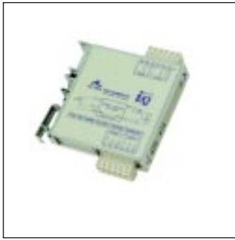
Q510-0xxx (2 Channel) Q510-4xxx (4 Channel)