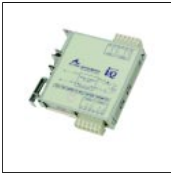
Q501-1xxx (1 channel out) Q501-2xxx (2 channel out)