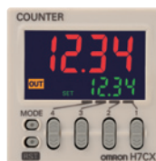
Light gray (sold separately)

Note: Black front panel is a replacement part.