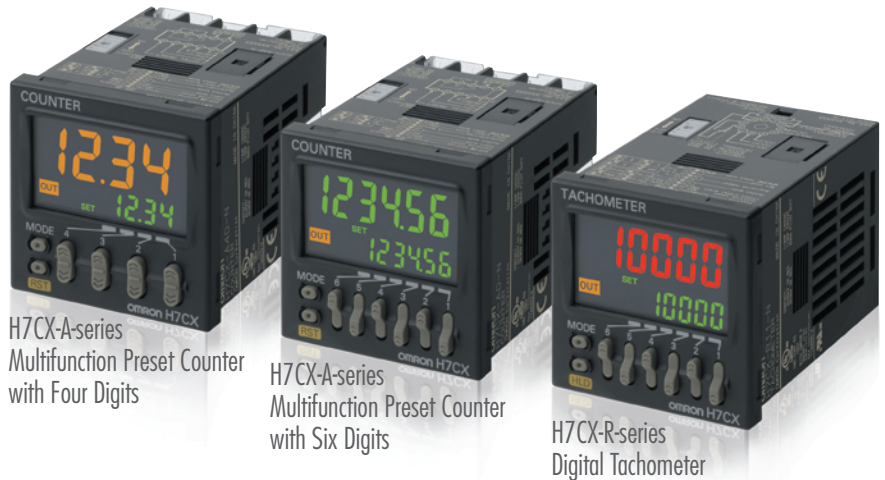
H7CX-A-series Multifunction Preset Counter with Four Digits