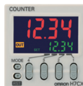
White (sold separately)

OMRON ELECTRONICS LLC • THE AMERICAS HEADQUARTERS • Schaumburg, IL USA • 847.843.7900 • 800.556.6766 • www.omron247.com