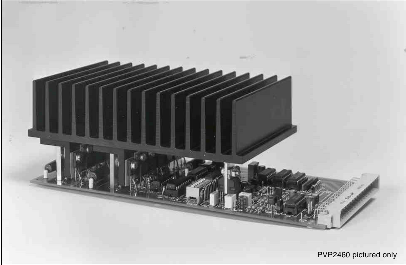
PVP2460 pictured only

The Series 24 range of stepper motor drives, manufactured by Alzanti, have been developed to meet the growing demand for high performance, cost effective, bipolar drivers. They have been designed to be compatible with the specifications of many stepper motors, with options available to suit numerous applications. PWM chopper regulation provides a very efficient motor drive stage, extending the useful speed range of motors whilst reducing heat dissipation and power consumption.