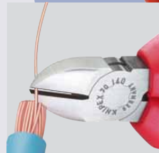
Cuts fine wires cleanly over the complete length of the blades