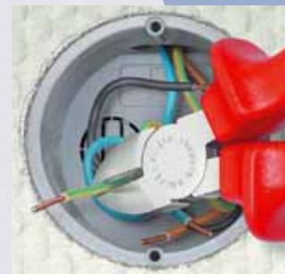
Slim head style and precise cut at blade tips: Advantageous when working in confined areas