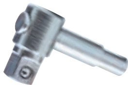
Plain Square Drive "A"