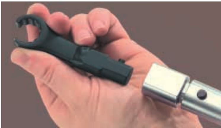
Head changes are quick and easy without the need for recalibration.

NOTE: Single setting wrenches do not have a scale and must be set on torque tester. When ordering these preset tools, specify desired torque setting.