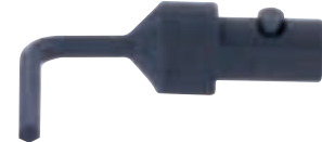
Hex Keys U.S. Standard "A"