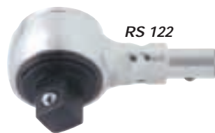
Ratcheting Square Drive "A"