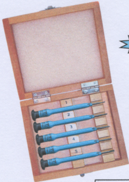
Stock No. 73-0902