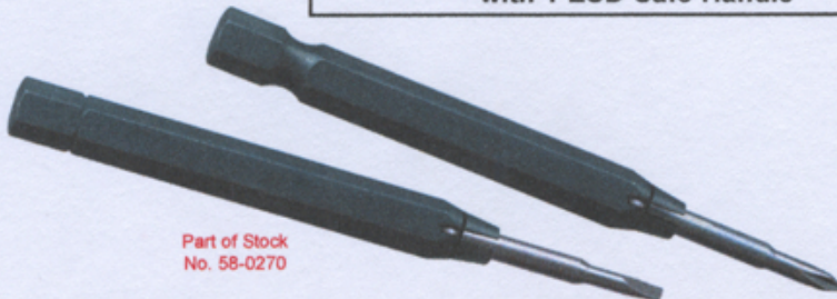
Part of Stock No. 58-0270