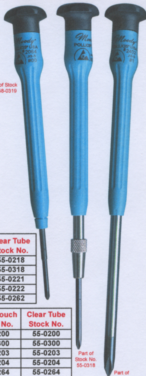
Part of Stock No. 58-0319