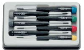
▲ 4785 7 PIECE ELECTRONIC SCREWDRIVERS

Chrome plated steel handle. Hollow rotating head. Black steel blades. In plastic display and storage wallet. Phillips PH 0 Phillips PH 1 Slot 1.4, 2.0, 2.4, 3.0 mm (.039, .063, .079, .094")