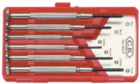
▲ 4850P 6 PIECE WATCHMAKER'S SCREWDRIVER SET

With additional T-grip. High alloy steel blades. Pressing blade Panel pry bar Screwdrivers, slot: tip: 0.5 mm and 2.0 mm (.020 and .079") Torx: TX5 Torx: TX6 Torx Tamperproof: TX8 Phillips: PH 1 Antenna-repair-tool: Type A and Type B