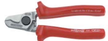
▲ 3964 ONE HAND CABLE CUTTER 165 mm 6.1/2" Perfect in design and quality, cuts this compact sized One Hand Cable Cutter copper and aluminium cables up to 14 mm Ø / 9/16" (50 mm) extremely easy and smooth. Razor sharp cutting edges with micro-serrations guarantee quality of non-squeeze cut and long life. Additional knife like edge for splicing of cable sheathing. Comfortable and safe C.K.-Redline grips with anti-slip horns. Chrome plated. Not for steel wires. Other patterns and sizes on request.