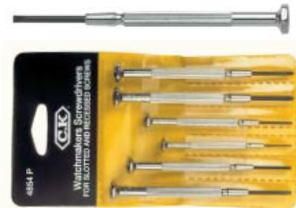
▲ 4854P 6 PIECE WATCHMAKER'S SCREWDRIVER SET

Chrome plated steel handle. Hollow rotating head. Black steel blades. In plastic box with hinged lid and blister. Phillips PH 0 Phillips PH 1 Slot 1.4, 2.0, 2.4, 3.0 mm (.039, .063, .079, .094")