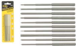
▲ 4857 10 PIECE TRIMMING TOOL SET (ALIGNMENT TOOLS)

Thermoplastic material. Length: 115 mm 4.1/2". On blister card. 0.7 x 1.0 mm □ 1.4 mm 0.5 x 1.3 mm ○ 1.8 mm 0.8 x 2.3 mm ○ 2.5 mm 0.7 x 2.4 mm Ø 4 mm 0.7 x 2.0 mm Ø 5 mm 1.3 mm Ø 3 mm 0.7 x 1.0 mm Ø 3 mm 0.8 x 1.3 mm Ø 3 mm 0.8 x 1.8 mm Ø 3 mm 0.7 x 2.4 mm Ø 4 mm