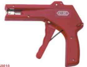
▲ 50010 TIE GUN FOR CABLE BINDER 165 mm 6.1/2" Fibre glass reinforced plastic body, light, yet strong. Pulling force adjustable. Cuts automatically as soon as the requested pulling force has been reached. For cable binder width 2.4 - 4.8 mm (.094 - .189").