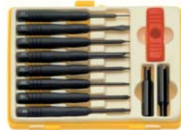
▲ 2430 10 PIECE CELLULAR PHONE MAINTENANCE TOOL KIT

Thermoplastic material. Length: 115 mm 4.1/2". On blister card. 0.7 x 1.0 mm □ 1.4 mm 0.5 x 1.3 mm ○ 1.8 mm 0.8 x 2.3 mm ○ 2.5 mm 0.7 x 2.4 mm Ø 4 mm 0.7 x 2.0 mm Ø 5 mm 1.3 mm Ø 3 mm 0.7 x 1.0 mm Ø 3 mm 0.8 x 1.3 mm Ø 3 mm 0.8 x 1.8 mm Ø 3 mm 0.7 x 2.4 mm Ø 4 mm