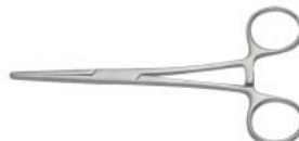
▲ 8030 CLAMP - SEIZER 145 mm 5.3/4" Stainless steel, fine polished, anti-glare finish. 3-position ratchet action lock. Straight jaws, serrated inside. Box joint.

Colour coded, rotating heads for ease of use. Blade length 40 mm / 1.1/2". In plastic box with hinged lid and blister. Slot 1.4, 2.0, 2.4, 3.0 mm (.039, .063, .079, .094") Phillips PH 0, PH 00, PH 000