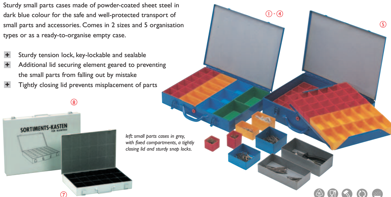
left: small parts cases in grey, with fixed compartments, a tightly closing lid and sturdy snap locks.