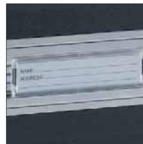
• Address label