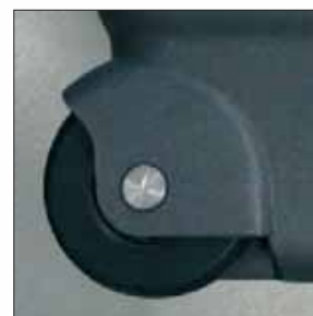
• Wheels on ball bearing

• Bottom area has removable dividers fixed directly on the shell body with no need of additional tray. Lightweight and higher load capacity are ensured.