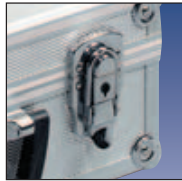
All cases are lockable