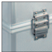
Sturdy hinges and edges