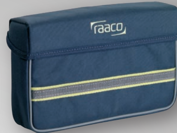
1/2 Pouch w. Cover

For storage of accessories and consumables. With two clips for easy mounting on Tool Taco.