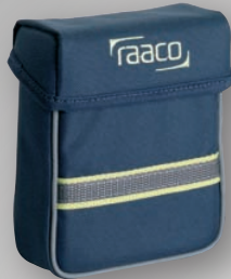
1/4 Pouch w. Cover

For storage of accessories and consumables. Strong clip with lock for secure mounting on Tool Taco.