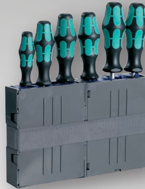
1/2 Tool Fix

Unique efficient holder for tools of any shape or size (max. Ø 30 mm). Strong velcro for mounting inside of Tool Taco and Open Pouch.