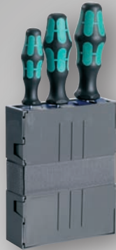
1/4 Tool Fix

Unique efficient holder for tools of any shape or size (max. Ø 30 mm). Strong velcro for mounting inside of Tool Taco and Open Pouch.