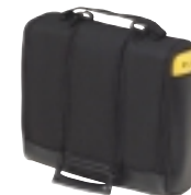
Cases & Holsters Compatibility Chart