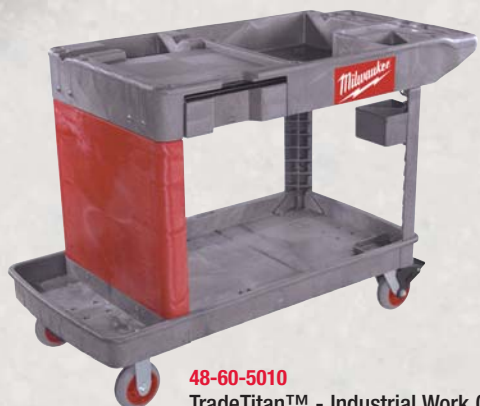
48-60-5010 TradeTitan™ - Industrial Work Cart

Designed specifically for the construction and maintenance trades, the Milwaukee Trade Titan Industrial Work Carts help get the job done faster and easier whether you are on the job, in the plant or in the shop.