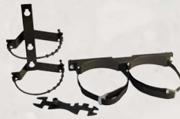
Tank & Extinguisher Kit