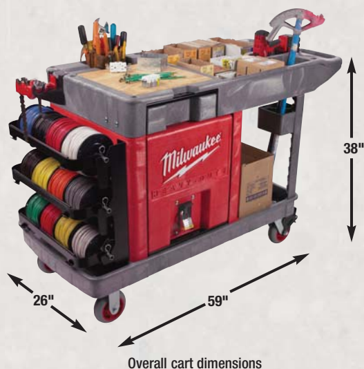
Overall cart dimensions

Industrial Grade 6" x 2" Casters easily conquer rough terrain and jobsite environments.