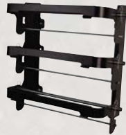
Wire Spool Rack