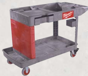
Trade Titan Open Cart

Everything an electrician needs to do their job is stored and organized on the Trade Titan™ cart. Tools, supplies and equipment are all easily accessible, mobile and secure. Three removable wire caddies and a heavy duty chain vise make daily tasks quick and easy.