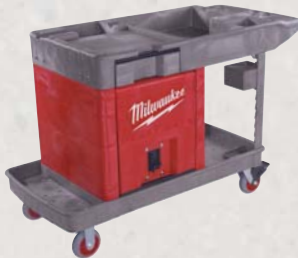
Trade Titan Cabinet Cart

The Heavy Duty Tank and Fire Extinguisher Mounting Kit allow up to (2) 'B' size Acetylene tanks and (1) 20 lb fire extinguisher to be securely mounted to the front of the cart. The Tank Kit Includes (2) heavy duty mounting brackets and (1) regulator wrench.