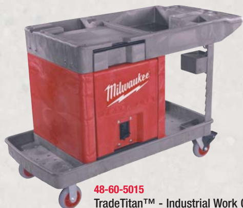
48-60-5015 TradeTitan™ - Industrial Work Cart with Locking Cabinet