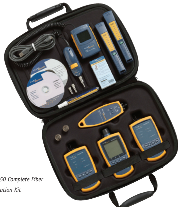
FKT1450 Complete Fiber Verification Kit