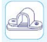
Spacer Bar Saddle