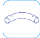
Normal Bend L.G.