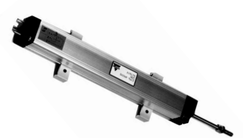
The 115 L is a simply mounted, robust, high precision industrial linear motion transducer.