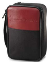
U1174A Soft carrying case