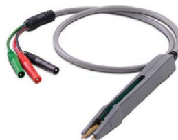
U1782A SMD tweezer