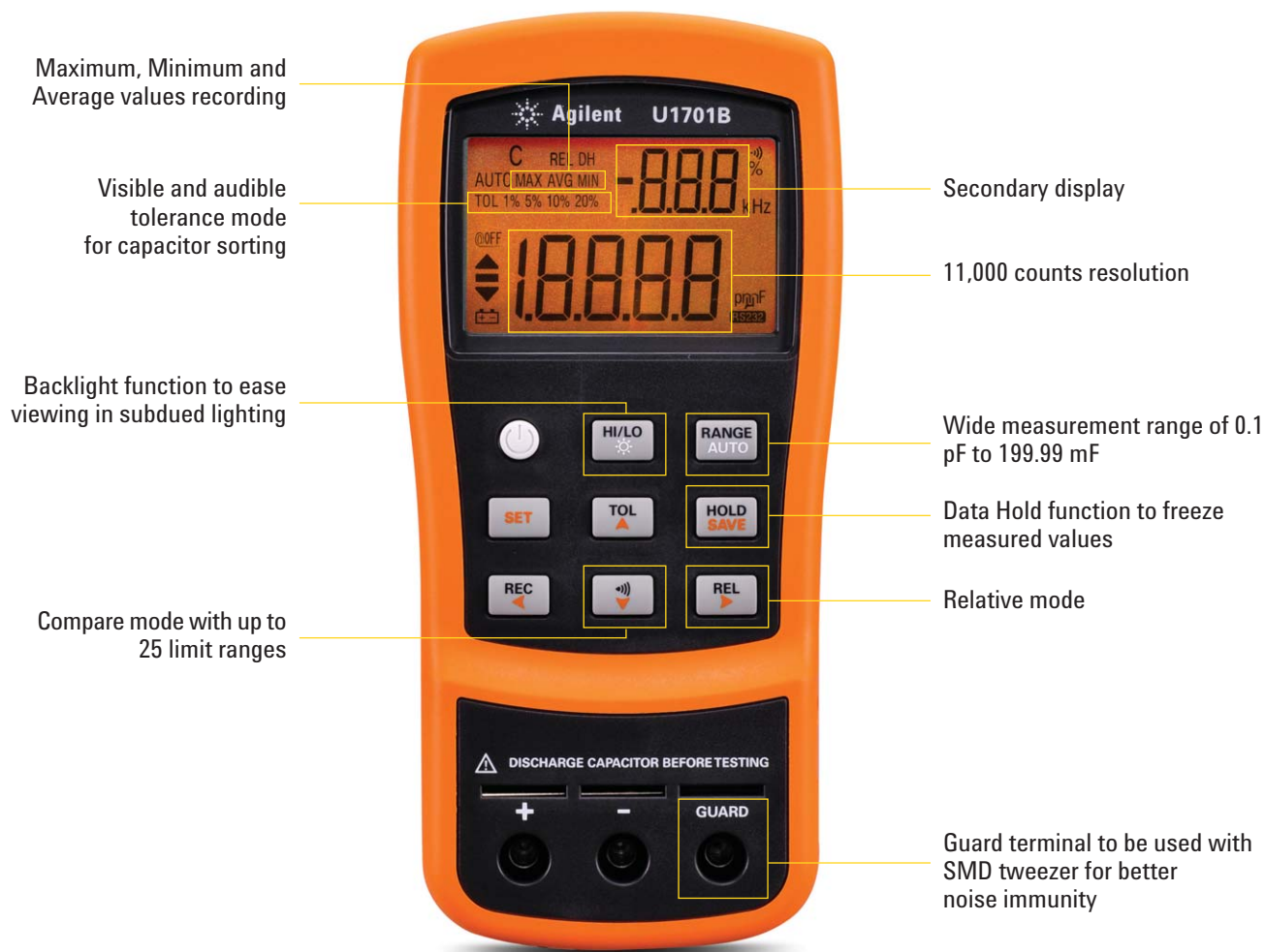
Figure 2: U1701B front view