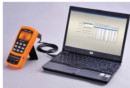
Figure 1: Automate the recording of continuous readings when you hook the U1701A/U1701B to a PC

The handheld capacitance meter comes in a robust overmold and tested to stringent industrial standards. Each capacitance meter is also sealed with a three-year warranty and the assurance that you can test your components with confidence.