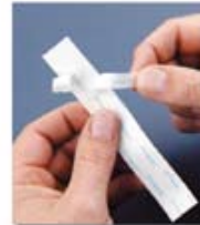
Easy-peel split-back label