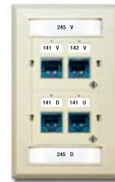
Fixed Length Labels