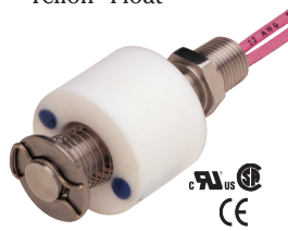
LS-1700 Series – Teflon® Float