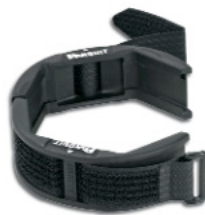
Jacket Cover with Hook and Loop Fastener

The PANDUIT cable bundle organizing tool efficiently arranges up to 24 data cables to optimize bundle size and improve installed appearance. The organized cables can then be easily secured using PANDUIT ® TAK-TY ® Hook & Loop Cable Ties. Two insert sizes accommodate a wide range of cable diameters for greater installation flexibility. The tool's ergonomic, compact design is comfortable for installers to handle and also works well in tight spaces. This user-friendly tool reduces cable installation time up to 50%.