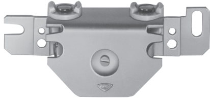
Cat. No. 1064