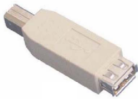
Mini-B Plug (4 PIN)