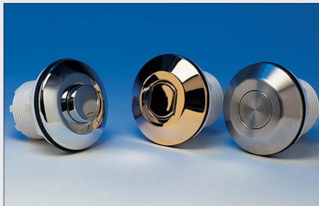
Stainless &amp; Chrome Options